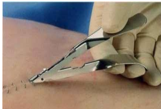
Figure: Removing staples with staple remover