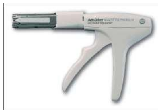
Figure: Skin staple

Of the many risk factors influencing post operative wound healing, the method of skin closure has been implicated as one of the important factors [6, 1, 7]. Conventional surgical suture is the commonly used method, and use of skin staples is relatively newer technique. There are prospective randomized trial studies performed on abdominal and other wounds only