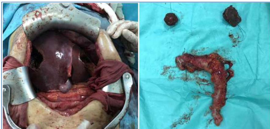
Fig-3: Metastasectomy associated with a left hemicolectomy (iconography of the visceral surgery department of Arrazi hospital)