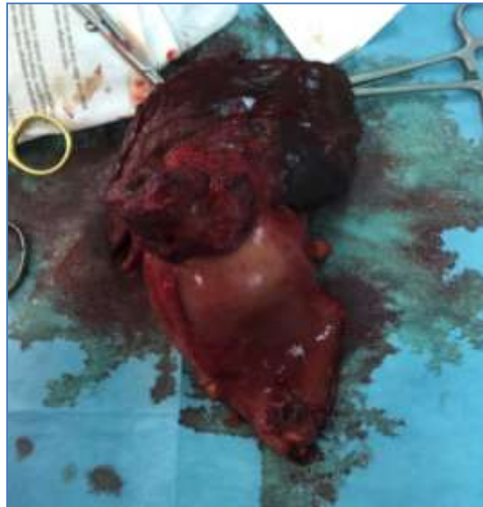
Fig-2 : Hepatic bisegmentectomy (IV + V) removing the tumor gall bladder and gastric antrum (iconography of the visceral surgery department of Arrazi hospital)

never been realized. For additional acts, 2 major gestures haven't been achieved : one partial gastrectomy (figure 2) and one left hemicolectomy (figure 3).