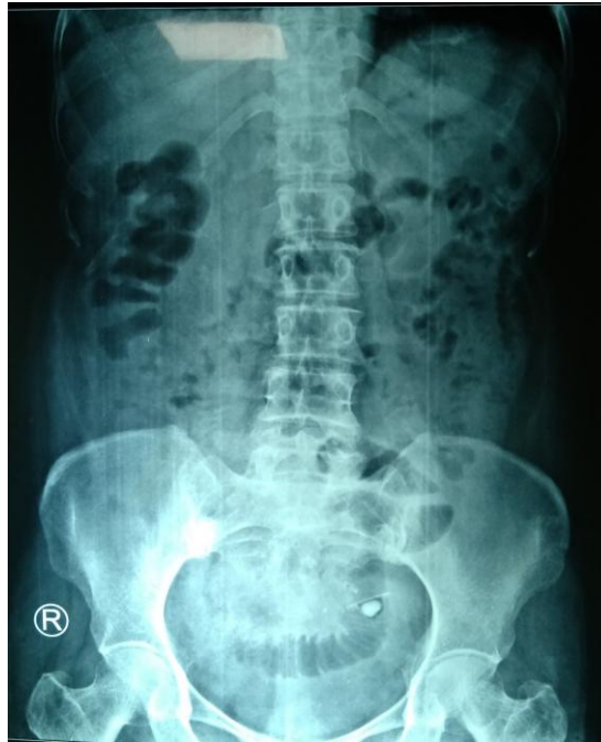
Straight Xray abdomen showed radio opaque shadow in left hemipelvis near the Left Sacroiliac joint

With failure of conservative measures, the patient was taken up for Colonoscopy & proceed. On table colonoscopy failed to remove the impacted foreign body. Midline laparotomy done. Thick walled rectosigmoid junction with localised perforation walled off with small bowel seen. As bowel was thick walled, oedematous, closing off the perforation is not feasible.