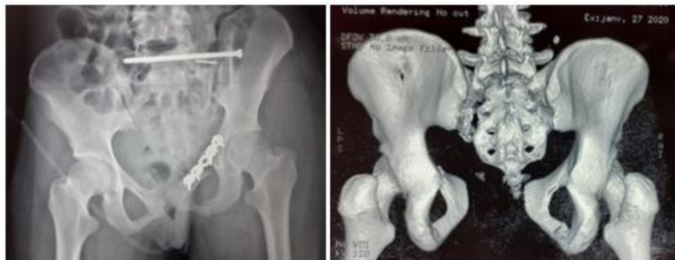
Fig-03: Imaging of a multiple trauma patient having suffered a stroke: left hip dislocation fracture with fracture of the lower end of the radius: preoperative 3D CT (a) reconstruction, and postoperative x-ray of the pelvis (sacroiliac screwing) and special acetabular plate on the left)