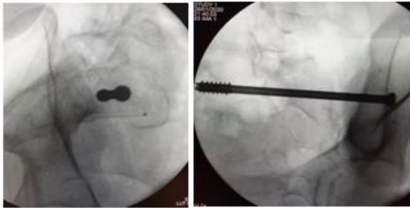
Fig-01: Decubitus Dorsal installation and marking in

As complications, residual pain was noted in two patients, lameness was observed in one patient. All of our patients have returned to work. We noted no cases of vicious callus, non-union, or thromboembolic complications.