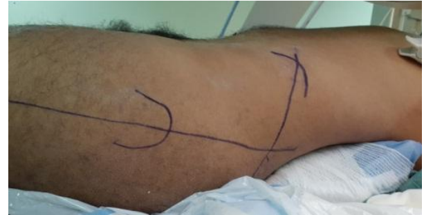
Fig-02: fluoroscopic control of the splined screw on an incidence point of introduction of the guide pin. front (a) and profile (b)