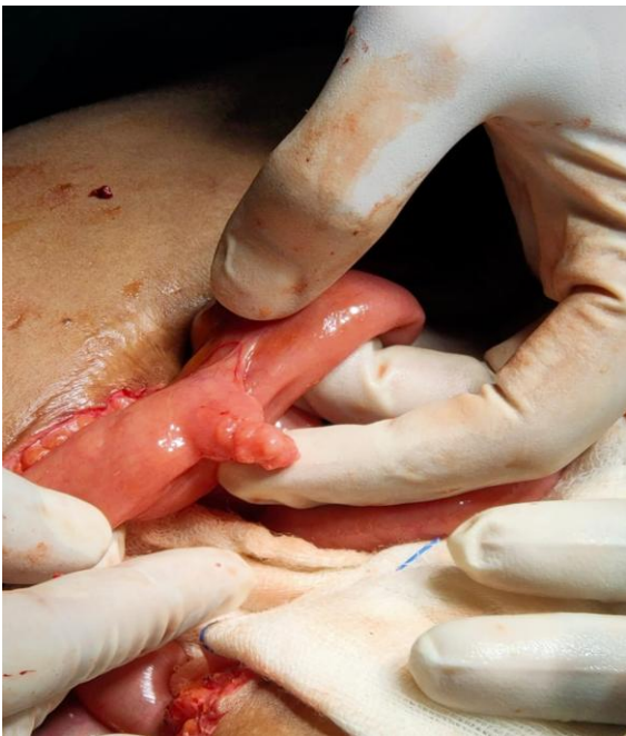
Fig 1: Meckel's Diverticulitis