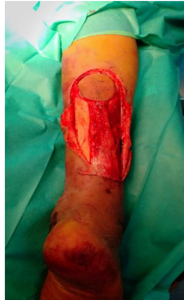
Lifting of the sural neurocutaneous flap with distal pedicle, broad vessel carrier