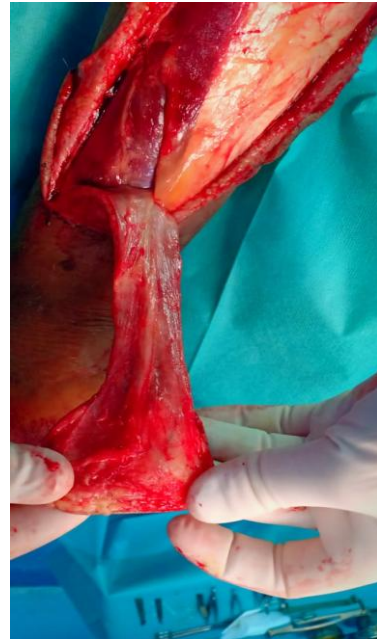
Lifting the flap; visualization of the pedicle