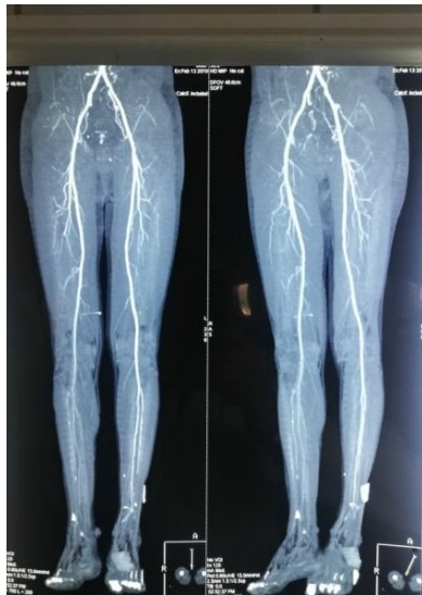
Normal angioscan, suspicion of vascular injury.