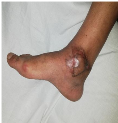
Appearance at one year