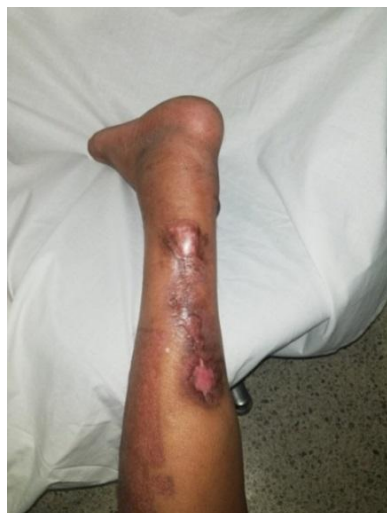
One year, flap donor area and skin grafts