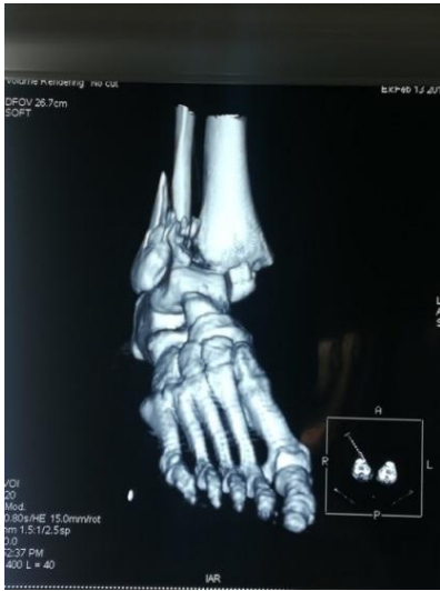
53-year-old man with bimalleolar open fracture following a fall from a ladder

The limb is immobilized 15—21 days depending on the patient, the flap is autonomous at 21 days.