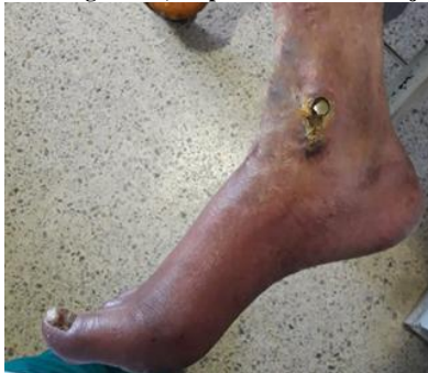
Exposure of the osteosynthesis material, and defect of the internal malleolus