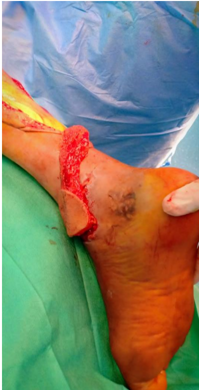
Rotation of the sural flap to cover the post traumatic defect at the level of the internal malleolus, externalized pedicle