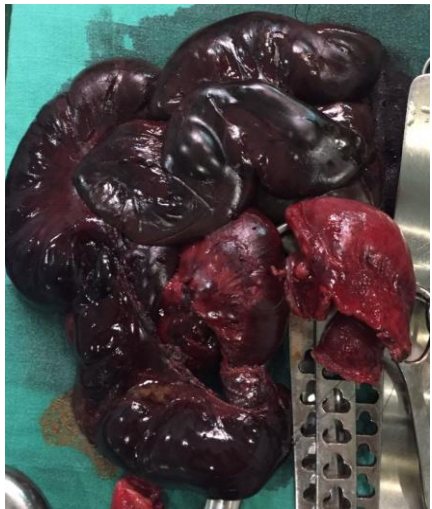
Fig-4: Resected part of the necrotic small intestine