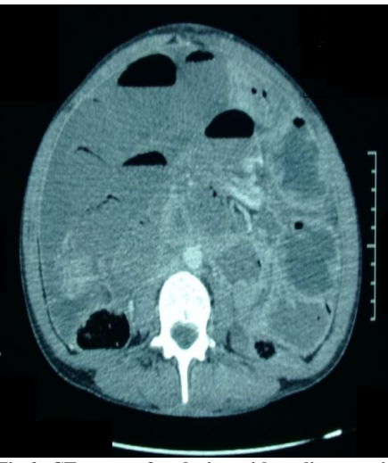
Fig-2: CT aspect of occlusion with grelic necrosis