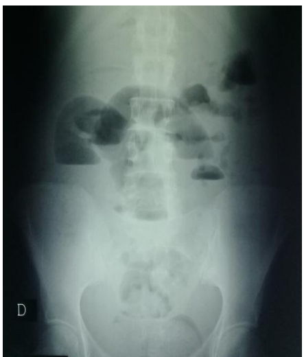
Fig-1: ASP showing hail-like hydro-aeric levels

The postoperative course was simple, after stay in the intensive care unit for 2 days the patient left the hospital on day 7, and came back 2 months to restore digestive continuity.