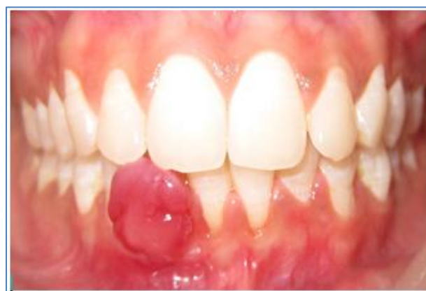
Fig-1: Pyogenic granuloma irt 42 and 43

sciences, Narketpally, Telangana, with a complaint of gingival overgrowth and bleeding in lower right region of the jaw. Macroscopic appearance of this lesion was a pedunculated mass in the interproximal region of 42 and 43 extended on entire labial aspect of respective teeth, which appeared almost round in shape. It was reddish pink covered by cream-colored mucosa. The surface was uneven with shallow grooves in some areas. The lesion was approximately 10 mm × 8 mm in diameters and 5 mm in thickness with relatively soft consistency (Figure 1).