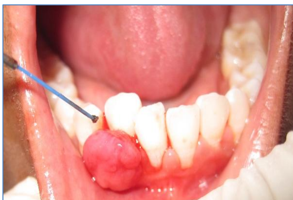
Fig-2: Excision of the lesion with laser

The laser device is classified as Class 4 laser system, especially designed safety glasses were provided to the patient, operator, and dental assistant for protection of the eyes from the laser beam. Oral hygiene instructions were reinforced after the treatment. An elliptical incision was made around the peduncle, and then the lesion was lifted along with the underlying periosteum from the bone surface and removed until soft tissue were eliminated.