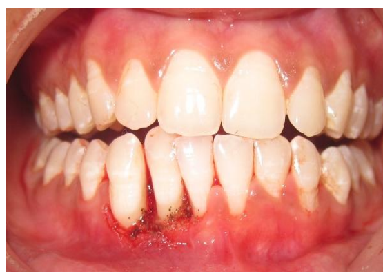
Fig-4: Immediate post- operative view