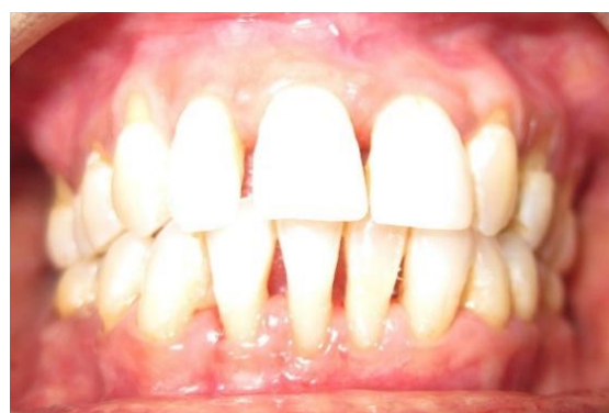
Fig-5: Post - operative view after 3 months