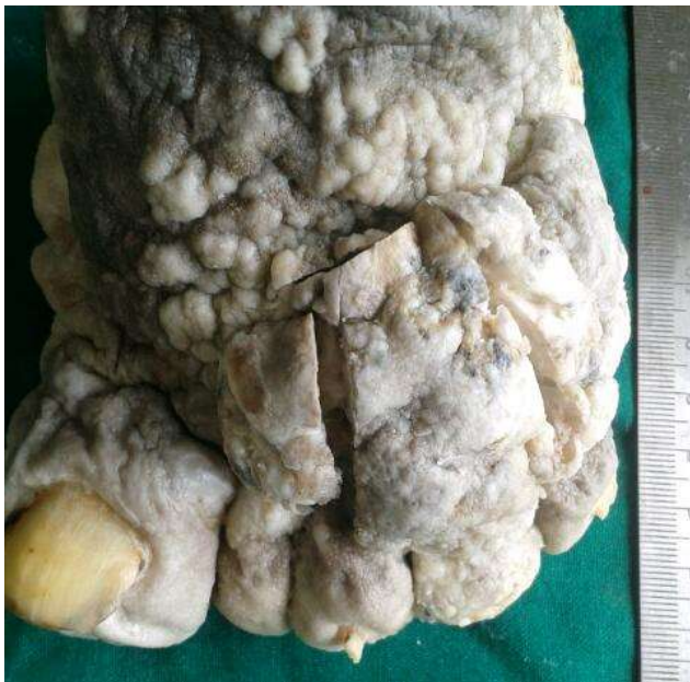
Fig 1: Gross: Verrucous, cauliflower like growth on dorsum of foot

mild dysplasia with focal dyskeratosis, mounds of parakeratosis and epithelial pearl formation [Fig2]. Sub epithelial stroma was fibrocollagenous with focal lymphocytic infiltration. Sections from the ulcer edge showed nonspecific chronic inflammatory changes. Resected margin and bones were devoid of tumor cells.