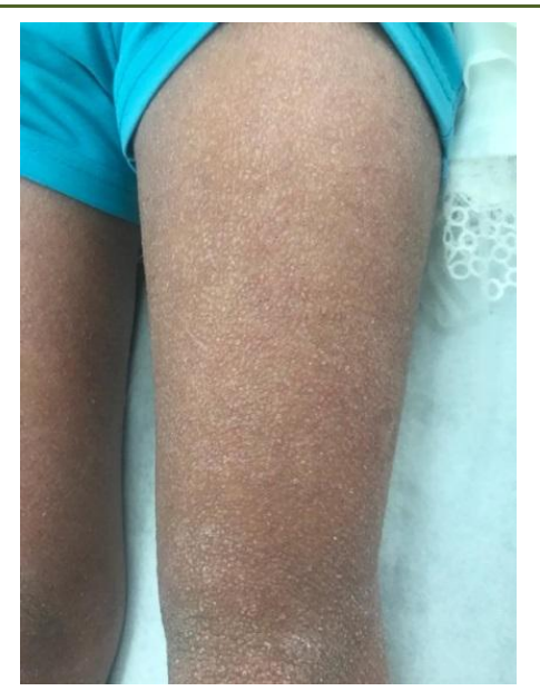
Fig-2: Clinical view of papular lesions on the thighs