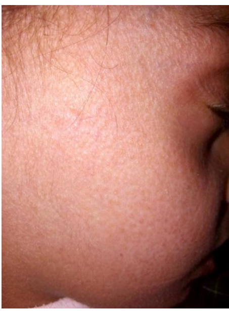
Fig-3: Clinical appearance of multiple papular lesions on the face

No lesions on the mucous membranes, or nail dystrophy were present. There was no family history of a similar condition. The patient received oral ivermectin 1 tablet once per week for 3 weeks - according to her weight - for the treatment of possible scabies, but no improvement was noted. She was also given oral amoxicillin-clavulanate for 2 weeks with resolution of the impetiginized lesions. Blood tests including a complete blood count, renal and liver function tests, CRP, and anti-streptolysin-O (ASO), showed no abnormalities.