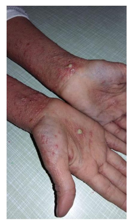
Fig-1: Clinical view of palmar lesions

The dermatological examination showed disseminated small skin-colored papules over her face, neck, chest, abdomen, back, both arms and legs, with brownish hyperkeratotic papules and plaques on the palms, the lateral aspect of the fingers and soles. The presence of follicular pustules over her abdomen, and multiple impetiginized lesions on her scalp, face, and arms was also noted ( fig 1-3 ).