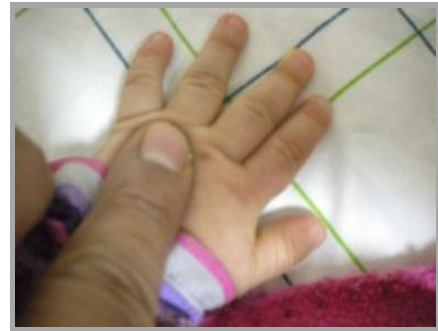
Fig-3: Picture of the hand