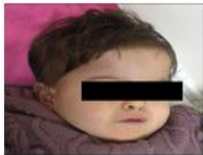
Fig-2: Facial dysmorphia