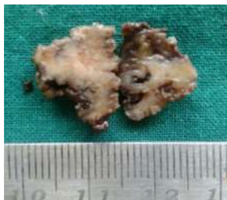
Fig 1: Cut section of the tumour is showing predominantly grey white areas with foci of cystic degeneration

skin lesion was made and a differential diagnosis of skin adnexal tumour was considered. Excisional biopsy of the mass was performed. Grossly tumour was unencapsulated measuring around 3x2x1cm, grey white to grey brown in colour [Fig 1]. Formalin fixed paraffin embedded routine H&E sections revealed lobules of tumour cells under the epidermis, having eosinophilic-cytoplasm, uniform round to oval nucleus, interspersed with collection of few cells having clear cytoplasm. No evidence of atypical mitosis or necrosis [Fig 2]. Histopathological impression of acrospiroma was rendered.