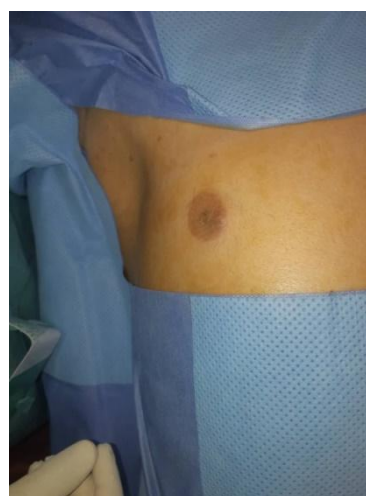
Fig-1: Retro areolar nodul

A 34 years old men, professor, non smoker, presented a painful retro-areolar tumor of his right breast, 1 cm in diameter, slightly squamous on the surface. There was no nipple discharge from either breast but there were enlarged lymph node of 2 cm, firm and mobile, in the left axilla without any discharge. There were no other complaints, No suggestive history of tuberculosis was declared with a good overall physical condition. Serology assays was not demanded as the patient didn't present risk factors