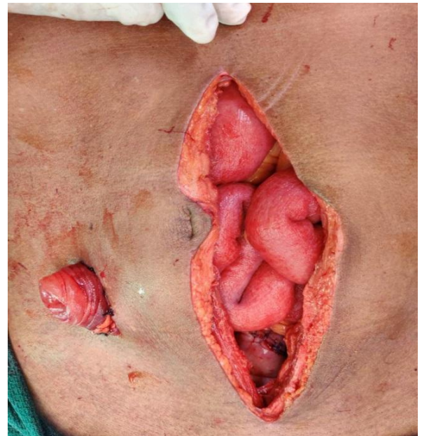
Fig-4: Double barrel ileostomy in right iliac fossa