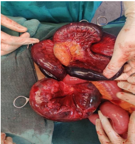
Fig-2: Gangrenous ileal loops above and gangrenous sigmoid colon below