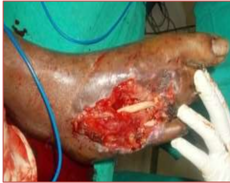
Fig-5: Distal defect of foot exposing tendon