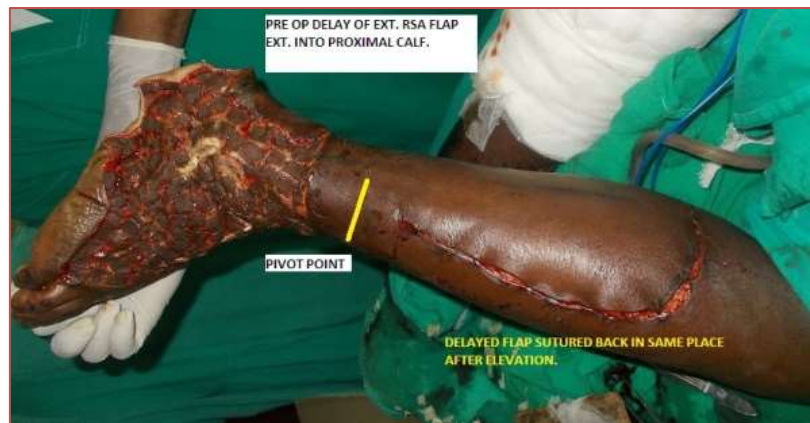
Fig-3: Resuturing of the flap to the donor site after preop delay