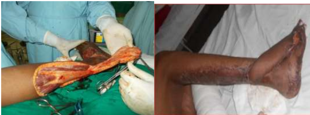
Fig-7: Pre op & post of Foot defect reconstructed with Ext.RSA flap with prior delay

#Ext: Extended, RSA – Reversed Sural Artery Flap