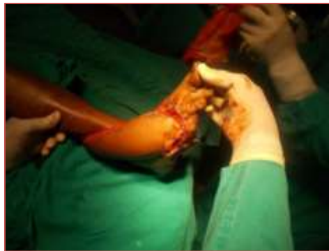
Fig-6: Post op reconstruction of dorsal defect Extended RSA flap with prior delay