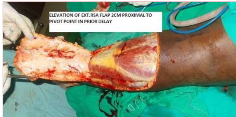
Fig-2: Elevation of the Extended RSA flap