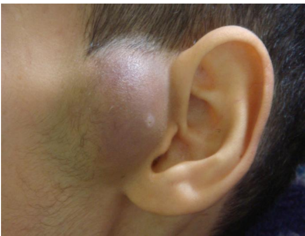
Fig-2: Pulsating mass at the left temple