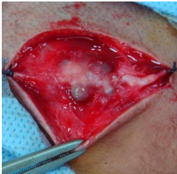
Fig-3: Peroperative picture of the flattening of the left aneurysm of the superficial temporal artery