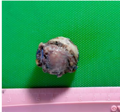
Figure 6: Macroscopic view of the specimen: showing the diameter of the resected tumor