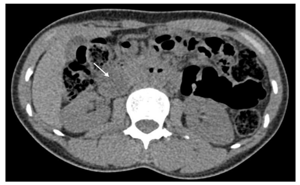
Figure 1: Abdominal CT scan without PDC injection, axial sequence: well-defined retroperitoneal mass (white arrow), lateralized on the right, round shaped, with regular contours, spontaneously hypodense and heterogeneous.

To better characterize this mass, CT of the abdomen and pelvis after the injection of an intravenous contrast agent (PDC) was performed and revealed a well-defined retroperitoneal mass lateralized on the right, round shaped, with regular contours, spontaneously hypodense and heterogeneous (Figure 1), intensely and heterogeneously enhanced after injection of PDC in the arterial phase (Figure 2), delimiting liquid areas, with progressively washing in the portal and late phases. The mass measured 30 x 29 x 37 mm and had close connection to the inferior vena cava (IVC) and the right renal vascular pedicle (Figure 3 and 4). It was also intimately related to the head of pancreas and the right kidney but not infiltrating them. There was no lymphadenopathy. These findings were more consistent with a retroperitoneal neuroendocrine tumor.