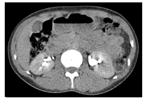
Figure 4: Abdominal CT scan with PDC injection: late phase, axial sequence: late washing of the mass.

Neck and chest CT scans were unremarkable. Urine normetadrenaline (metanephrine) was elevated at 451 ug/24h (normal range < 51 ug/24h). Scintigraphy with 123-I labeled metaiodobenzylguanidine (MIBG) was also negative.