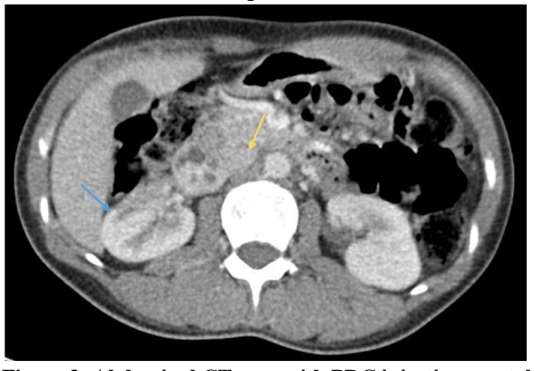
Figure 3: Abdominal CT scan with PDC injection: portal phase, axial sequence: the mass is adjacent to the right kidney (blue arrow) and the IVC (yellow arrow), with discrete washing.

Figure 2: Abdominal CT scan with PDC injection: arterial phase, axial sequence: the mass is intensely and heterogeneously enhanced after injection of PDC (the solid component).