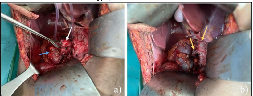
Figure 5: Intraoperative image of the paraganglioma (before (a) and after the resection (b)): the mass (white arrow) was adjacent to the right kidney (blue arrow) with intimate contact to the IVC and the right renal vein (yellow arrows)

Paraganglioma) estimated to 2 (well differentiated type)