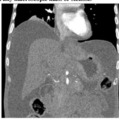
Fig-2: CT in axial sections with sagittal and coronal reconstruction: Thickening of the large and the small curvature extended to the cardia