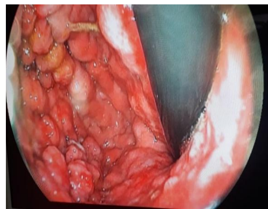
Fig-1: Endoscopic image reveals very thickened folds in both curvatures, with a very hyperemic mucosa and multiple ulcers, without any macroscopic mass or stenosis

Associated with a circumferential and irregular thickening of D2 and D3, stenosing and locally infiltrating and responsible for dilation of the pancreatic ducts. A peritoneal effusion of great abundance. Multiples lung nodules, without any hepatic nodules. And so it was decided to perform palliative surgery using gastroenteroanastomosis. And biopsies of the lung nodules. The gastric biopsies show the typical histological aspect of MD (hyperplastic gastropathy with hypertrophy foveolar), and the lung lesion is compatible with adenocarcinoma. In the postoperative follow-up he presented 3 episodes of low abundance hematemesis. He died 3 months after the intervention due to progression of the neoplasm.