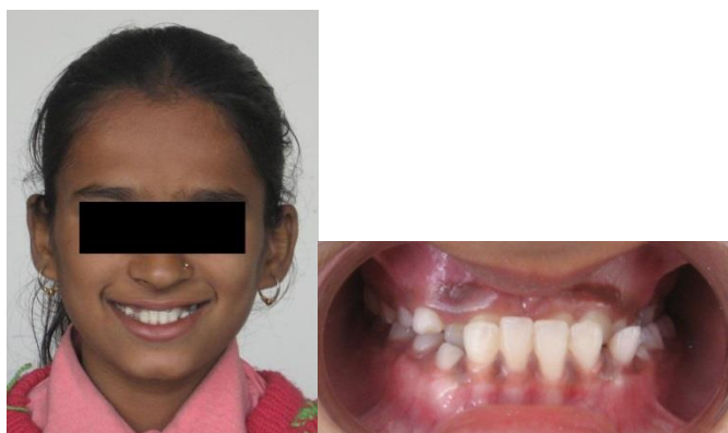
Fig-1: Pre-treatment photographs