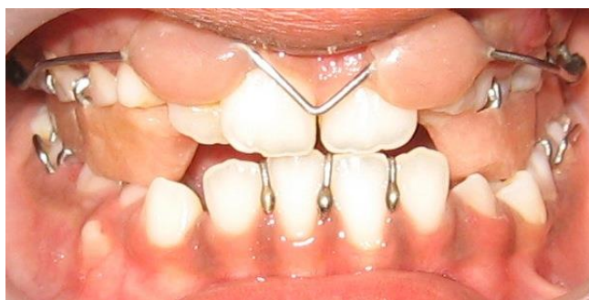
Fig-3: Stage photographs showing RTB

Construction bite was registered with incisors in edge to edge occlusion. RTB was fitted and prescribed for full time wear (Fig. 3). Patient was instructed to give one turn per week to three way expansion screw which was incorporated in maxillary appliance for sagittal and transverse expansion. To increase the forward movement of upper labial segment, lip pads were added in maxillary appliance. They were routinely adjusted so as to keep them clear of upper incisors. Total treatment time was eight months.