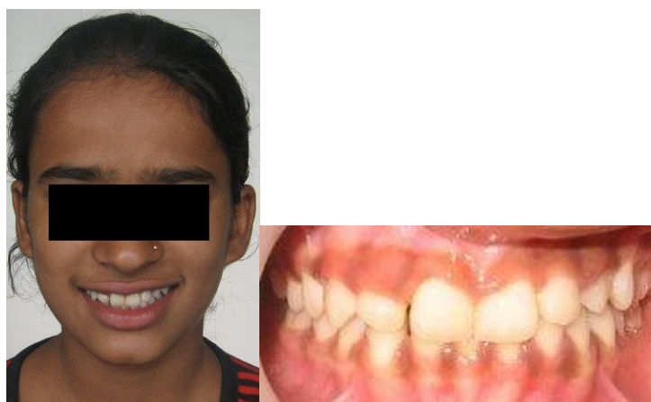
Fig-4: Post-treatment photographs

was increase in lower anterior facial height. There was a noticeable improvement in patient's profile (Fig. 4, 5, 6). Patient was quite satisfied with the results obtained and rejected the option of fixed mechanotherapy for further detailing of occlusion.