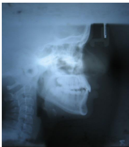
Fig-5: Post-treatment radiographs