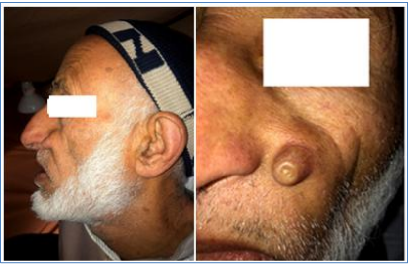
Fig-1: Exuberant tumor of the left nasolabial fold

This is a 69-year-old mountain man with no particular pathological history who presented to the otorhinolaryngology consultation of the military field hospital for a swelling of the left nasolabial fold evolving for 05 years without associated clinical signs apart from a psychic and aesthetic impact (fig. 1).