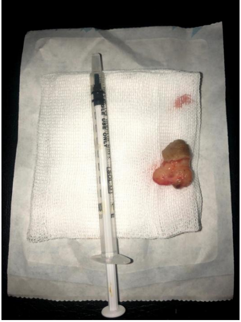
Fig-2: Complete removal of the tumor

The patient benefited, under local anesthesia, from a surgical intervention which allowed the complete excision of the tumor with safety margins of 0.5cm. Dissection of the tumor was easy and the closure was made by bringing the edges of the incision into two planes. (fig. 2-3).