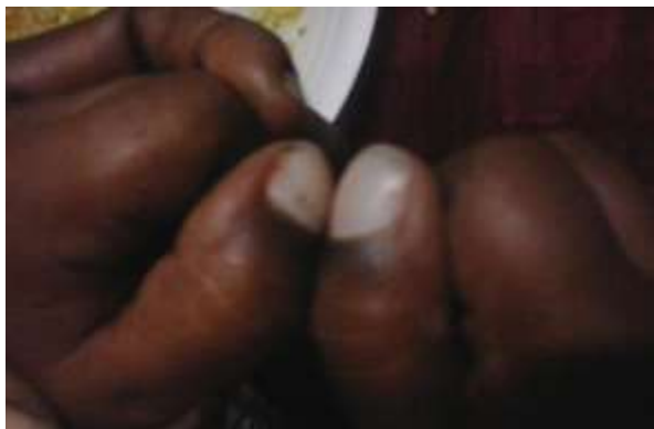
Fig. 2: Bilateral clubbing

The patient was worked up for any hidden disease. Blood test revealed normal range except Hb-6 gm% MP ICT (optimal) was positive. Widal test was negative. Routine microscopy of urine was normal. Chest X-Ray and ECG were normal. X-Ray of hand and foot showed no abnormality. The abdominal examination revealed mild enlargement of spleen in midaxillary line towards umbilicus. Splenic notch was not palpable. The photos of grandmothers hand and patients hand taken. They are very similar.