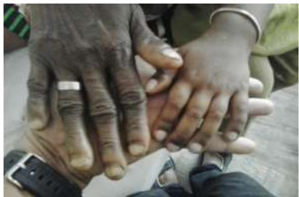
Fig. 3: similar type of clubbing in grandmother and patient