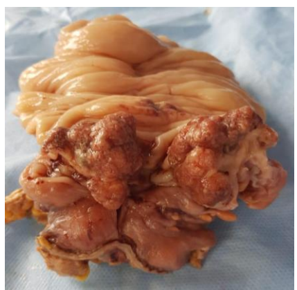
Fig-4: Macroscopic pathological examination