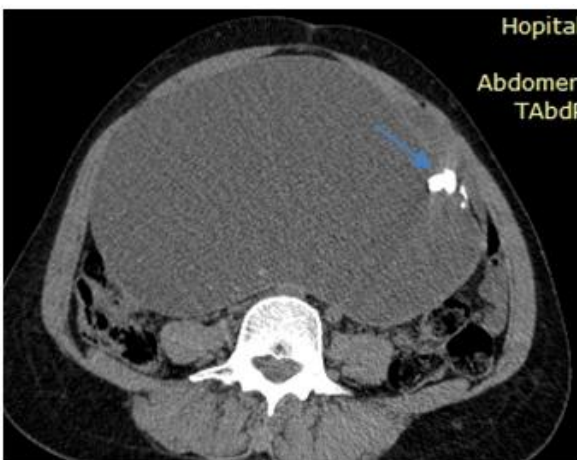
Fig-3: Axial ct scan shows the calcifications (arrow) within a cystic mass