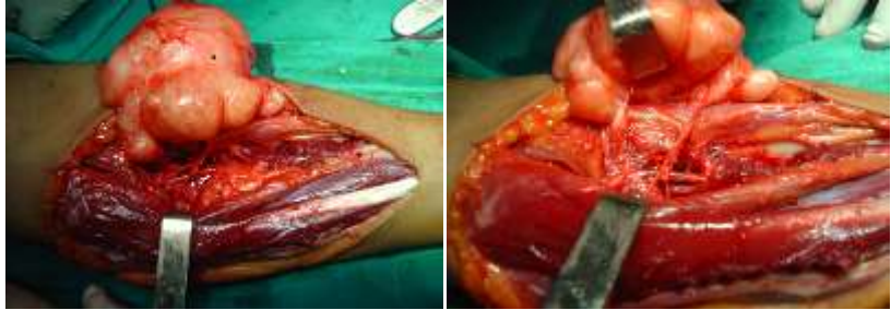
Fig-2: Intraoperative view of the lesion showing that the mass at the forearm was originated from the median nerve

A longitudinal incision centered over the tumor bulk was performed. Surgical exploration brought to light an encapsulated tumor firmly attached to the median nerve, which was easily resected (Figure 2).