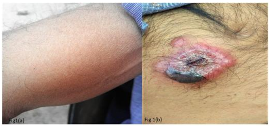
Fig-1(a&b): Swelling over right arm and Ulcerated painful erythematous nodule over abdomen near umbilicus.