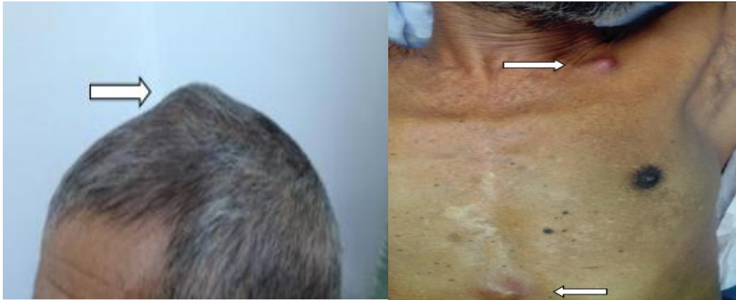
Fig 1 & 2: Nodules in the chest and scalp

The thoracoabdominal computed tomography (CT) scan revealed an invasion of the stomach, peritoneal carcinomatosis and ascitis (Figure-3). Palliative chemotherapy was indicated in the patient after a prechemotherapy check-up.