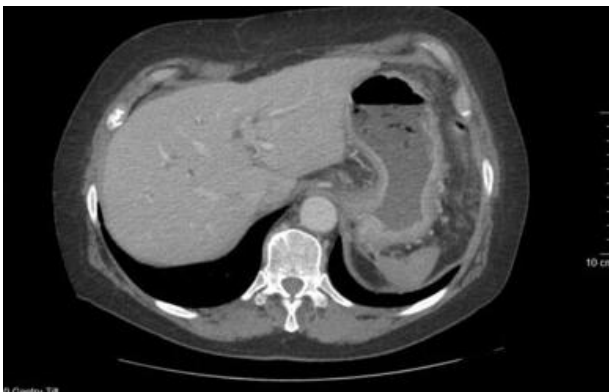
Fig-4: Abdomen scanner showed an infiltration of the gastric wall with peritoneal carcinomatosis and ascites