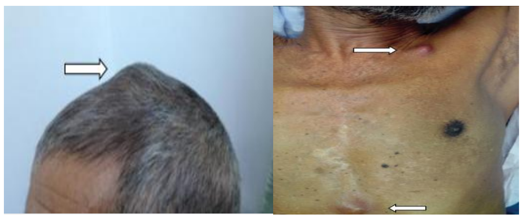
Fig 1 & 2: Nodules in the chest and scalp

The thoracoabdominal computed tomography (CT) scan revealed an invasion of the stomach, peritoneal carcinomatosis and ascitis (Figure-3). Palliative chemotherapy was indicated in the patient after a prechemotherapy check-up.