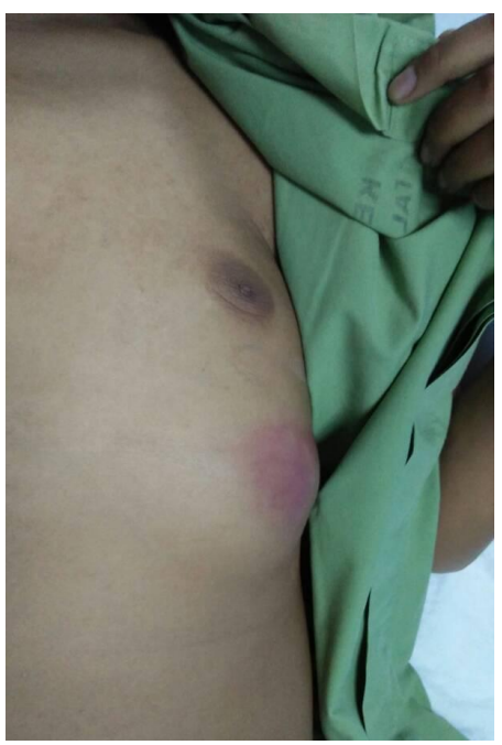
Fig-1: Large left chest wall swelling measured 10 x 10cm

He was discharged well one week after surgery.