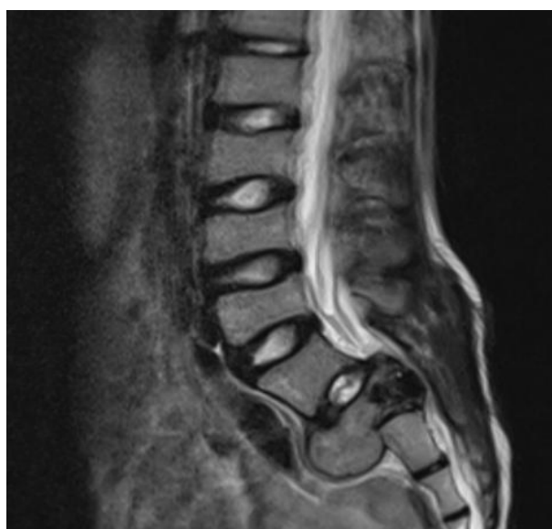
Fig-3: Sagittal MR image show a mass of the first sacral vertebra after second embolization

Histologically, GCTB contains three distinct cellular populations: multinucleated giant cells, recruited monocytes and bland stromal cells [6]. Areas of infarctoid necrosis are common, especially for large tumors. Historically, a GCTB classification system, based on the histological aspect of the tumor, was proposed by Jaffe and others in 1940 to stratify the