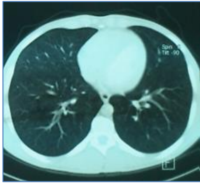
Fig-1b: Chest computed tomography on admission

The red blood cell count underlined leukocytosis at 33750 / mm 3 with a neutrophils predominance (PNN) at 27191 / mm 3 , and thrombocytopenia at 70000 / mm 3 . The transaminases were elevated, aspartate amino transferase (ASAT) at 104 IU / l (3xN); alanine aminotransferase (ALT) at 126 IU / l (3xN), total bilirubin (BT) at 591 mg / l (12xN), bilirubin conjugate (BC) at 448 mg / l (149xN), gammaglutamyl transferase ( \delta GT) at 46 IU / l, creatine phosphokinase (CPK) at 62 IU / l (N <113), urea at 1.26 g / l, serum creatinine at 13.6 g / l and CRP. 1. Tuberculin intradermal reaction and bacilloscopies were negative. Sterile blood cultures and ECBU.