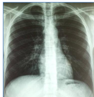
Fig-2: Control chest X-ray

Chest X-ray (Fig 2) after 10 days of treatment showed interstitial syndrome disappearance.