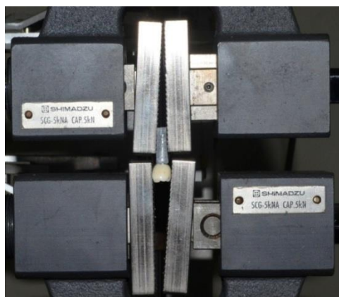
Fig-2: Testing the samples in Instron machine