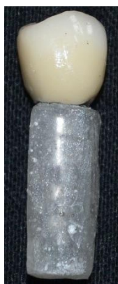
Fig-1: Implant fixture with all ceramic restoration mounted on acrylic base