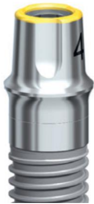
Fig-1: Nobel Replace® platform shift Tapered implant