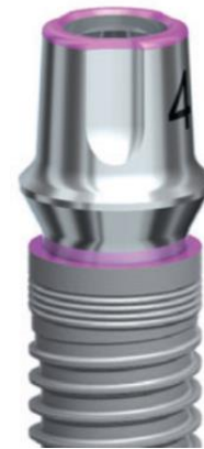
Fig- 2: Nobel Replace Select™ Tapered implant