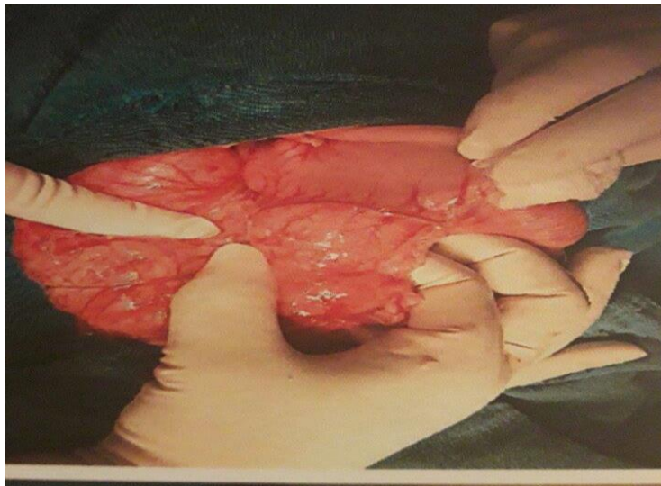
Fig-2: Laparotomy founded a cyst mass, it was excised with mucoclasia