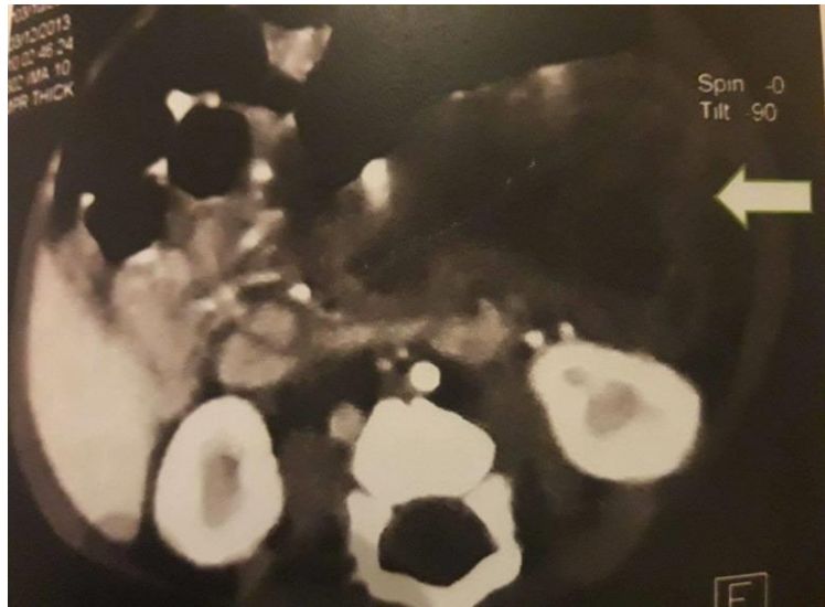
Fig-1: Scan of the abdomen demonstrated a cyst mass without any other mass or lymphadenopathy