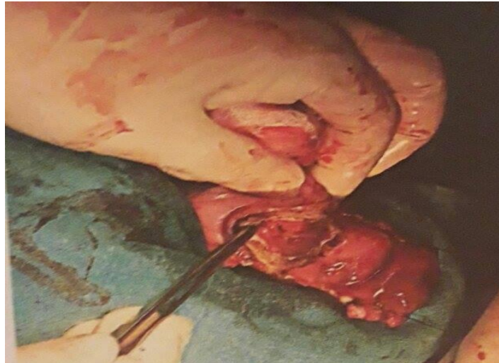
Fig-4: Exploring laparotomy confirmed the diagnosis and an excision with mucoclasia was practiced