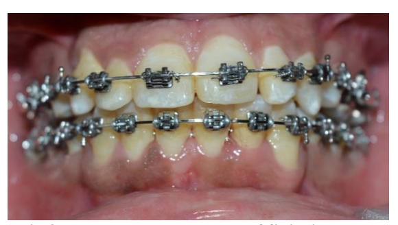
Fig 8: Intraoral photographs of finishing stage