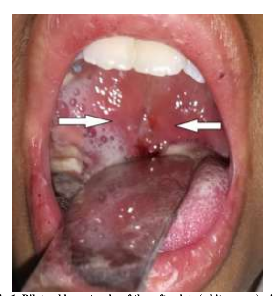
Fig-1: Bilateral hypertrophy of the soft palate (white arrow) with a median ovula pushed forward

A 9-year-old girl presented to the emergency department with a history of intermittent odynophagia, voice changes, and fever for 10 days. Prior to her emergency visit, she had been treated with amoxicillin with little improvement. She was otherwise healthy. Our examination revealed bilateral hypertrophy of the soft palate with a median uvula pushed forward (Figure-1). A cervical computed tomography CT scan showed bilateral peritonsillar abscesses (Figure-2). The otolaryngologist performed a bilateral needle aspiration and examined the fluid. Subsequently, an incision was made with general anesthesia; The left side drained 15cc of pus, and 10 cc of pus was evacuated from the lright peritonsillar area. The patient had a complete resolution of symptoms and was discharged and followed up with 14-day antibiotic treatment. Followup after discharge from the emergency department revealed total remission.