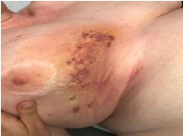
Fig-1: Red lesion in the infero-internal quadrant