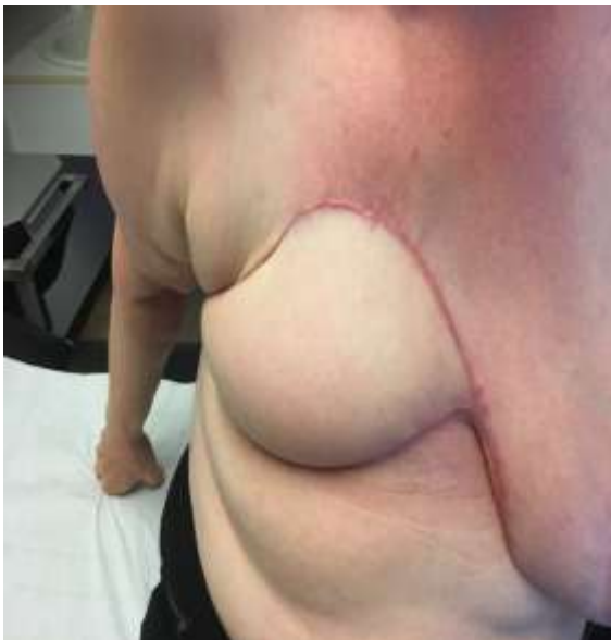
Fig-3: Purple nodule at the level of the upper bank of the mastectomy scar