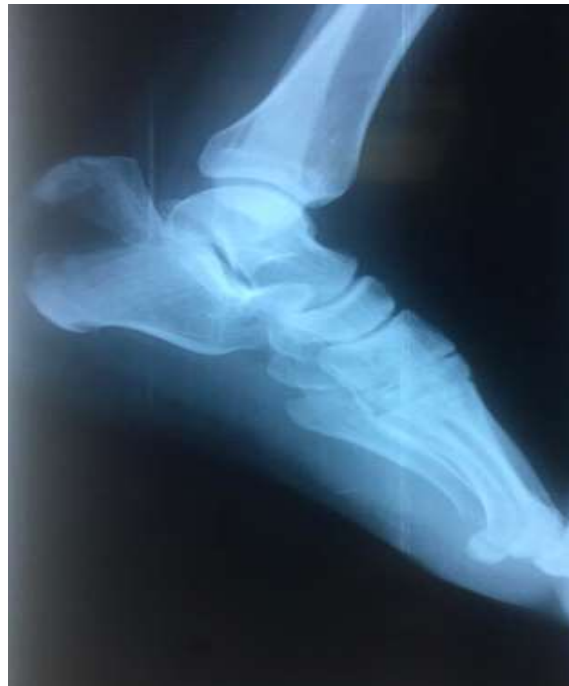
Fig-2: X rays showed the extra-articular avulsion fracture of the posteroinferior tuberosity of the calcaneus (type II)