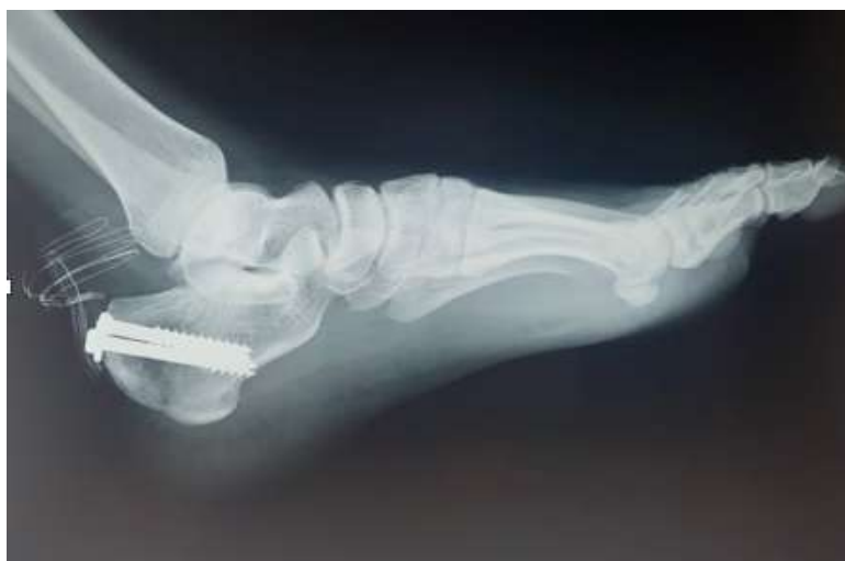
Fig-4: Ankle control profile x-ray. Screwing of the calcaneal tuberosity fracture with two cancellous screws