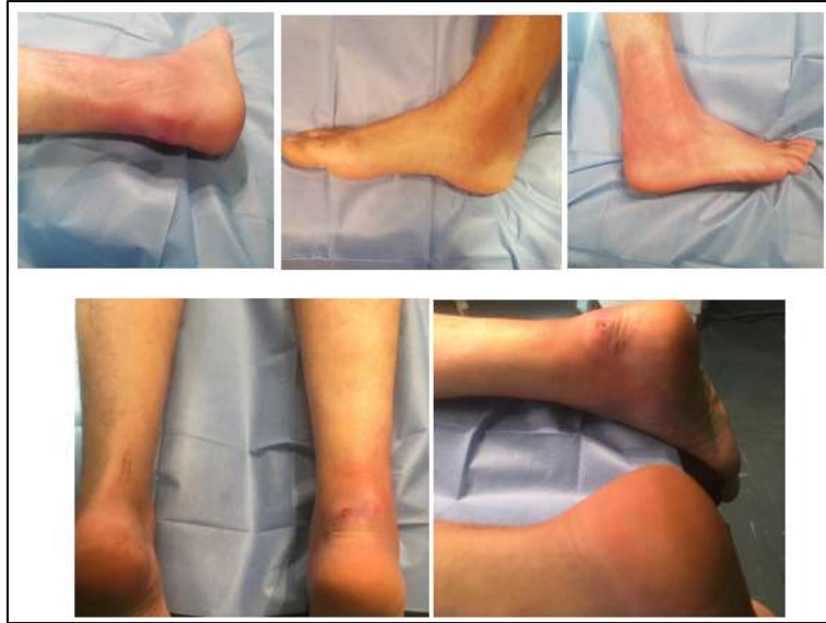
Fig-1: Clinical photos showed the skin impinged by the fragment