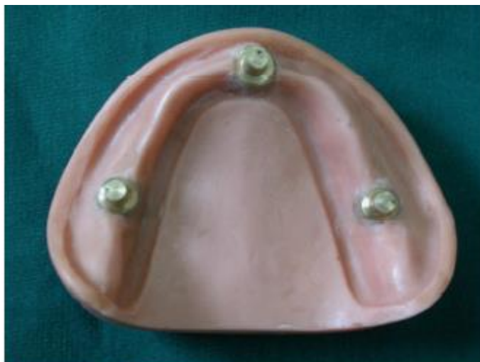
Fig 1: An acrylic resin model of edentulous mandible as the standard cast

An acrylic resin model of edentulous mandible was prepared, where each region of first right and left molars and anterior midline point of the arch, a metal cone was placed (the standard cast) [7]. In each metal cone, a small slot was prepared as the reference point of measurement (Fig 1) [15]. Impressions, in which all the regions and surface details were recorded, were made on the basis of standard cast and in accordance with any impression techniques studied.