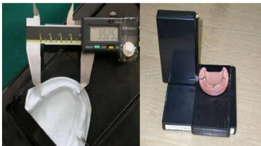
Fig 5: A Screen marker for measuring the length and width of the samples and standard model.

placed on the horizontal plane. The samples and digital caliper were positioned at an inclination of 45^\circ to another indicator placed on the horizontal plane [19-21]. In this position, the length of all samples was measured. It seems that this measuring method is the most accurate with the least possible error, considering available resources. In this way, the length and width of the standard cast and other casts were measured three times utilizing a digital caliper (Mitutoyo, England) with an accuracy of 0.01 mm. The means were considered as the dimensions of the casts (Figure 5). Data were statistically analyzed using one sample test and SPSS15 software.