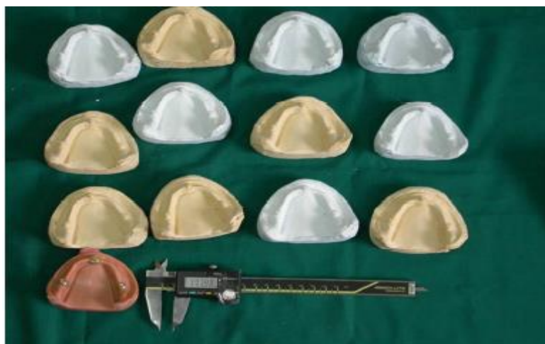
Fig 4: Cast preparation from Alginate, Dual Alginate and Compound impression.