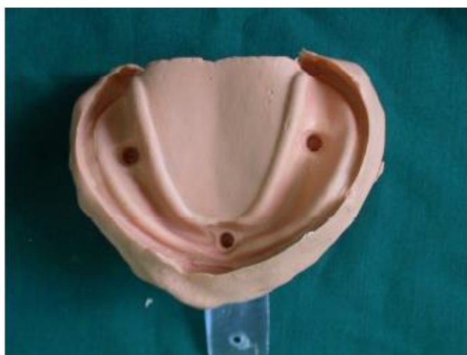
Fig 3: Dual Alginate impression.

a thin layer of alginate was applied into the impression and seated in the same position (Fig 3). In order to maintain the dimensional stability of impression materials, in all three techniques, the steps were carried out in 12 min from the impression making to the cast pouring.