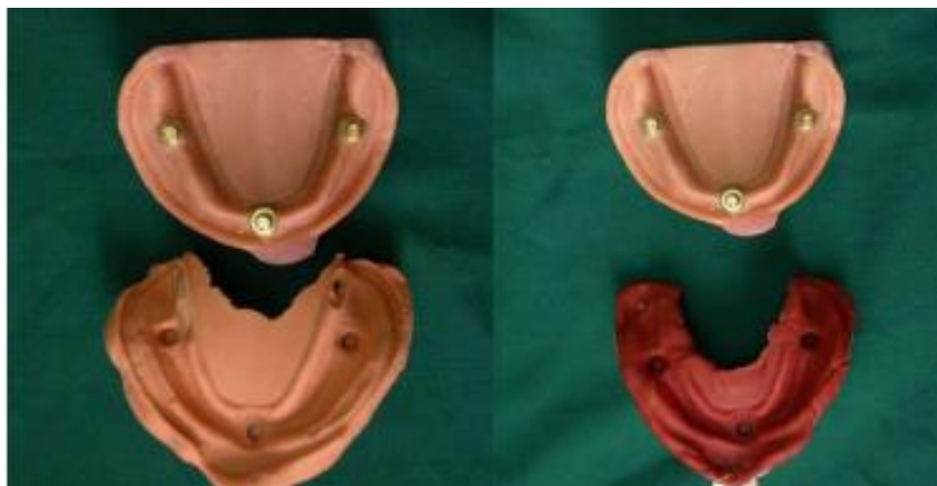
Fig 2: Alginate and red Compound impression making.

in the tray, the impression of the model was made, removed, rinsed under water and surface moisture was removed [17, 18]. Excess materials and undercuts were cut away using scalpel blade (Figs 2).