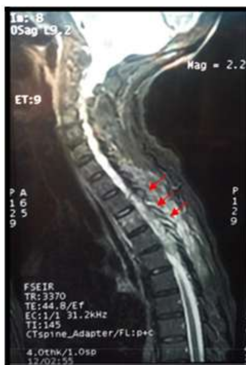
Fig-1: Sagittal plane of thoracic spine Magnetic resonance imaging show an epidural abscess at the level of D1 to D5 (arrows)

The evolution under treatment with clavulanic acid amoxicillin and gentamicin for two months was marked by the disappearance of neurological signs and clinic-biological infectious signs.