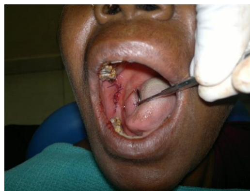
Fig-5: post suturing