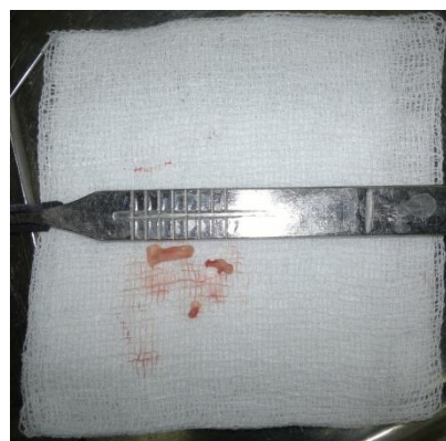
Fig-4: shows the resected length of nerve