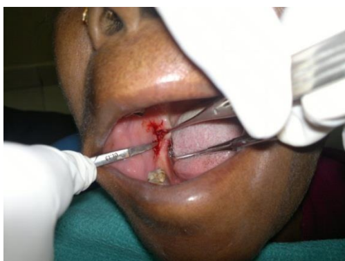
Fig-2: supra periosteal dissection with dissecting scissors