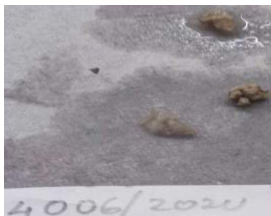
Fig-2: Gross examination. Multiple grey white soft tissue bits of tumor