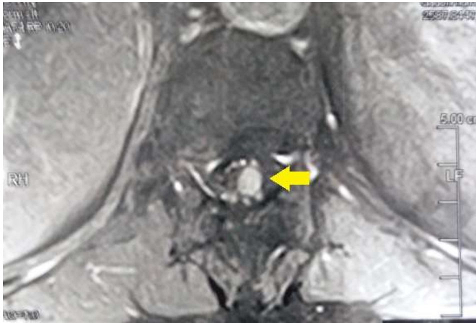
Fig-1: Axial MRI section showing an intramedullary process at level of medullary cone, in hyper signal T1 with injection of Gadolinium (yellow arrow)