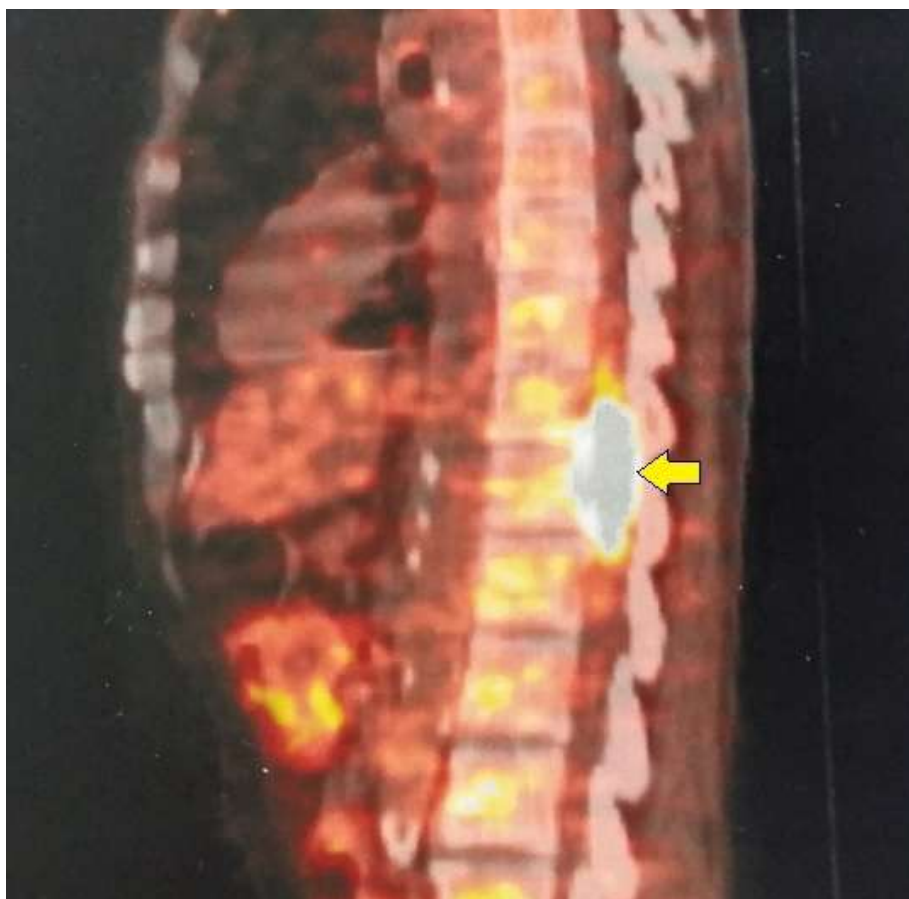
Fig-3: Sagittal PET-CT fusion image showing an intense intramedullary pathological hyper metabolism (yellow arrow)