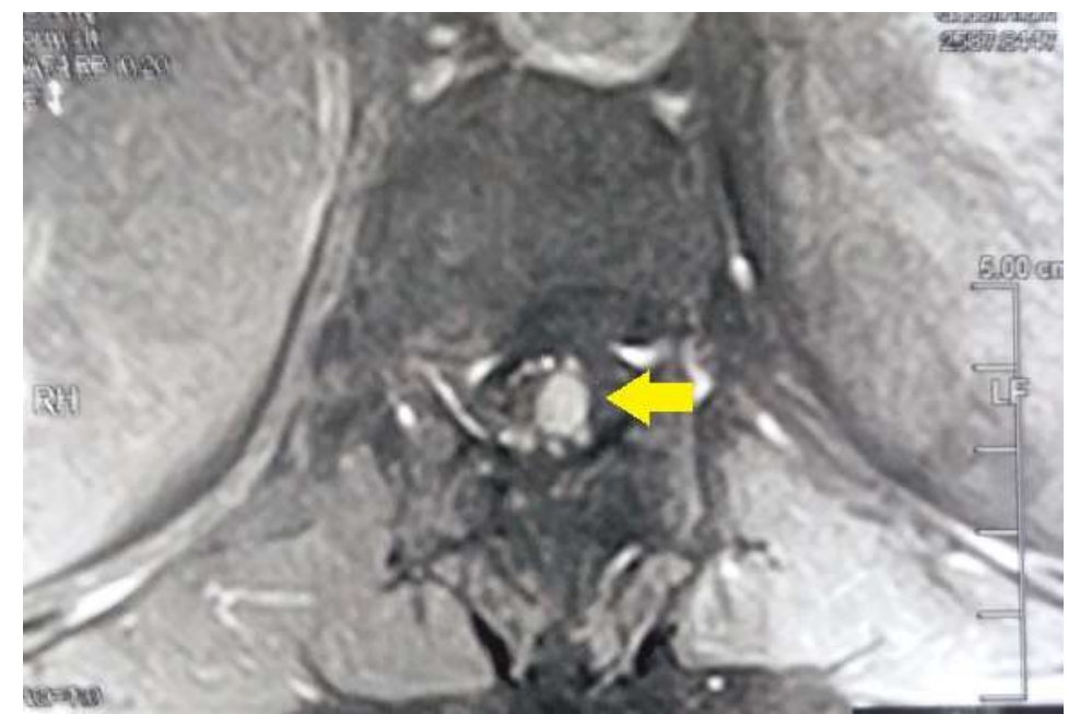
Fig-1: Axial MRI section showing an intramedullary process at level of medullary cone, in hyper signal T1 with injection of Gadolinium (yellow arrow)