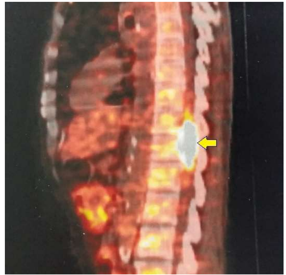
Fig-3: Sagittal PET-CT fusion image showing an intense intramedullary pathological hyper metabolism (yellow arrow)