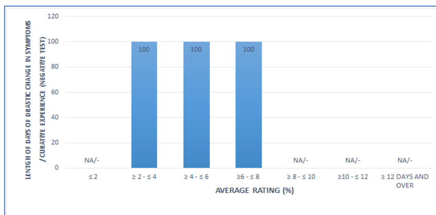
Fig-3: Length of days of drastic change in symptoms versus average curative ratings in %