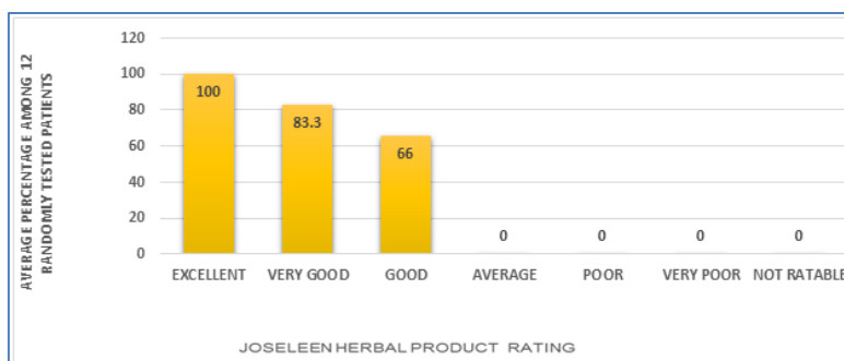
Fig-1: Joseleen Herbal lipids Mixture ratings

Overall Average Rating of Joseleen Herbal Mixture = 83.1 %