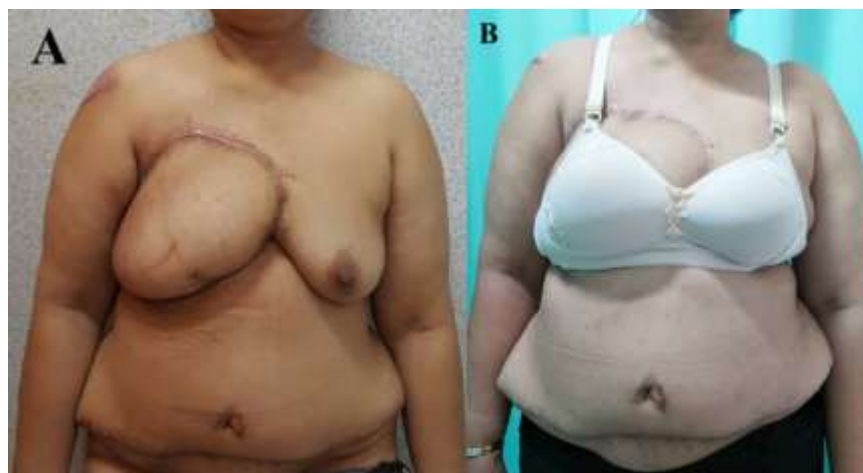
Fig-3: A: Post-operative outcome at 2 months. B: 6 months; patient on her undergarment (original pre-operative size)