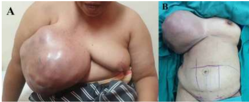
Fig-1: A&B: Pre-operative images