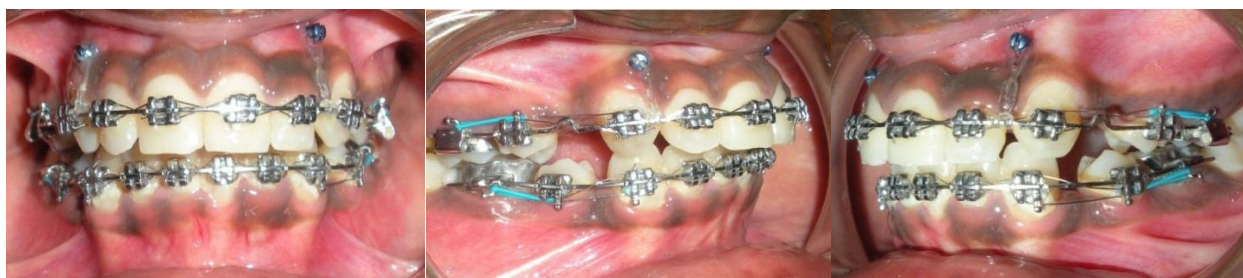
Fig-1: Mini implants placed between lateral incisors and canine for intrusion

True intrusion without axial inclination change can only be obtained by directing the intrusive force through the Cres of the anterior teeth [5]. In vitro studies using different methods such as the laser reflection technique and holographic interferometry, photo elastic stress analysis, and the finite element method as well as in-vivo studies have been performed to determine the CR of the incisors. The results show that the CR of the four incisor teeth lies 8 – 10 mm apical and 5 – 7 mm distal to the lateral incisors [1,5].