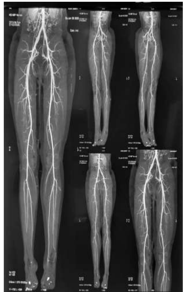
Fig-1: Doppler Venogram Ultrasound showing multiple thrombus occlusions

from 35.3, 37.8, 39.6 and 46.7) and fibrinogen values (181.3 mg/dl, 212.4 mg/dl, 129.8 mg/dl, 155.8 mg/dl and 143.2 mg/dl). The patient was shifted to the ward after the removal of the IVC filter; she was stable and kept for observation (aPTT 37.2 and fibrinogen on discharge 117.4 mg/dl). The drugs were prescribed for complaints of pain and were administered with Fentanyl-25mcg patch and Tramadol-50mg. On discharge, the patient was prescribed with tablet Apixaban 10 mg bid for a week also advised to reduce the dose to 5 mg bid for 6 months, Cefuroxime 500 mg bid for 5 days, Diosmin 500 mg bid, the combination of Pregabalin and Methylcobalamin 75 mg once daily for a month, Aspirin 75 mg once daily to be continued. The patient was advised to take Pantoprazole 20 mg in the morning and evening for prevention of complaints of gastric pain. Further, the patient confirmed with direct coombs test and advised to take the tablet. Hydroxy chloroquine. However, there are no signs and symptoms of SLE.