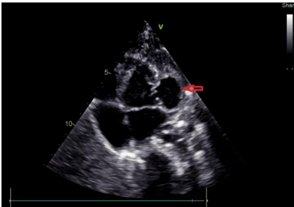
Fig-2: Echocardiographic apical four-chamber view showing LV Pseudo-aneurysm (Arrow)

hemodynamic improvement but patient persisted to be febrile. A repeat echo done on day 24 of illness showed large pericardial effusion with thick septation's, severe mitral regurgitation and no features of tamponade, no vegetations. Next day patient developed acute respiratory distress and heart failure. After reassessing, the patient was taken for complete pericardectomy. The intra-operative findings showed thickened and adherent pericardium to the right atrium and right ventricle, minimal pus and aneurysmal dilatation of left ventricle. Post-surgery Echocardiography revealed a 26x23mm submitral aneurysm (Figure-2) on the lateral aspect of the left ventricle with free flow of blood into & out of it, severe MR (Figure -3) and minimal organized pericardial effusion.