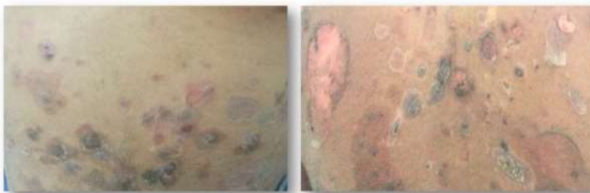
Fig 1: Patients Belly and Back picture showing large superficial ulcers and crust

Institute of Medical Sciences (SAIMS), Indore were enrolled for the study prospectively from May 2012 – Jan 2016. Laboratory evaluation that included hemoglobin, CBC, ESR, Blood sugar, Urine analysis, Kidney and liver function tests, Serum electrolytes, Chest X-ray, ECG, HIV, HBsAg and HCV tests were undertaken before starting treatment and during follow-up. CBC, serum electrolytes and ECG were repeated after the completion of each pulse. Diagnosis of pemphigus was based on clinical features(Figure 1), tzank smear(figure 2) and skin biopsy(Figure 3).Immunofluorescence could not be carried out in all the patients as the cost and affordability was a limiting factor.DCP was started after positive tzank smear and histopathological features of pemphigus.