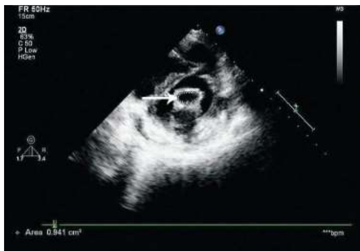
Fig-1: Transthoracic echocardiography confirmed revealed severe mitral stenosis with thickened mitral valve leaflets (ARROW)

generally good; the patient was discharged on the 11th postoperative day.